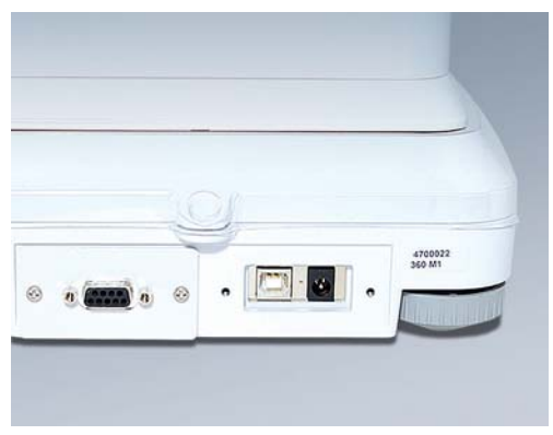
Advanced, multipurpose connectivity