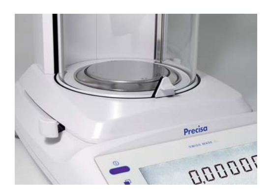
Round, ambidextrous draftshield for optimum conditions