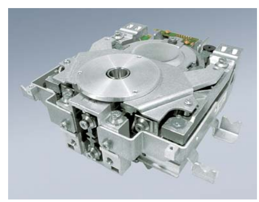
Pure Swiss precision at the heart of the balance