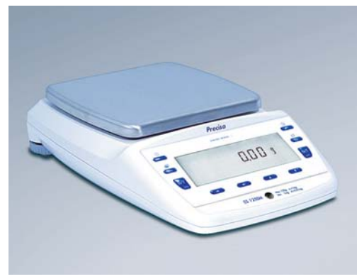
Compactly styled shape